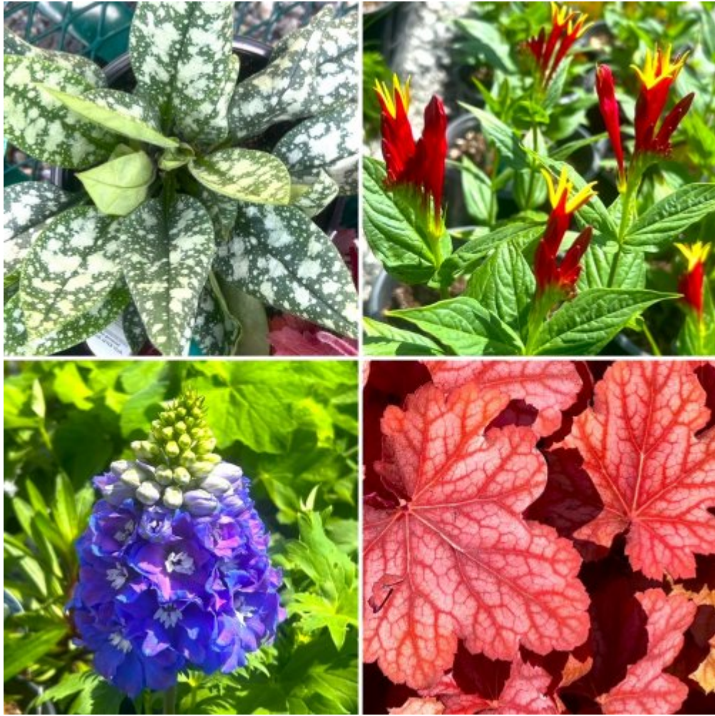
Perennials clockwise – Spigelia, Coral Bells, Delphinium, Pulmonaria