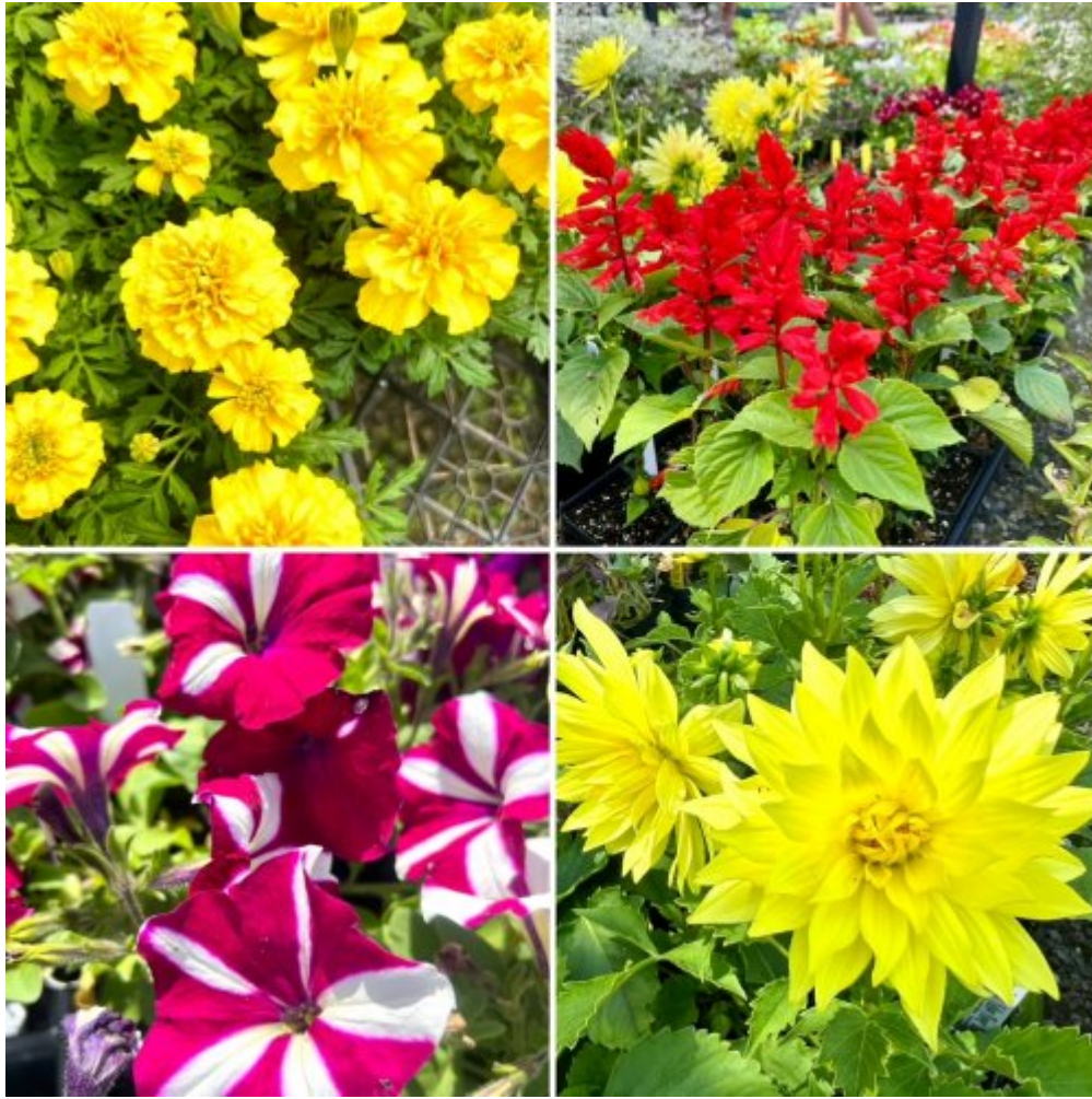
Annual Flowers clockwise – Red Salvia, Dahlia, Petunia, Marigold