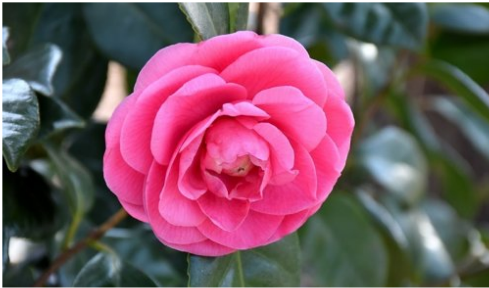
Camellia 'Jerry Hill'