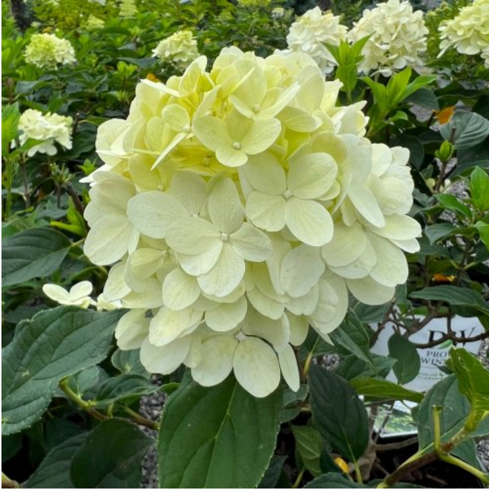
Hydrangea paniculata 'Limelight'