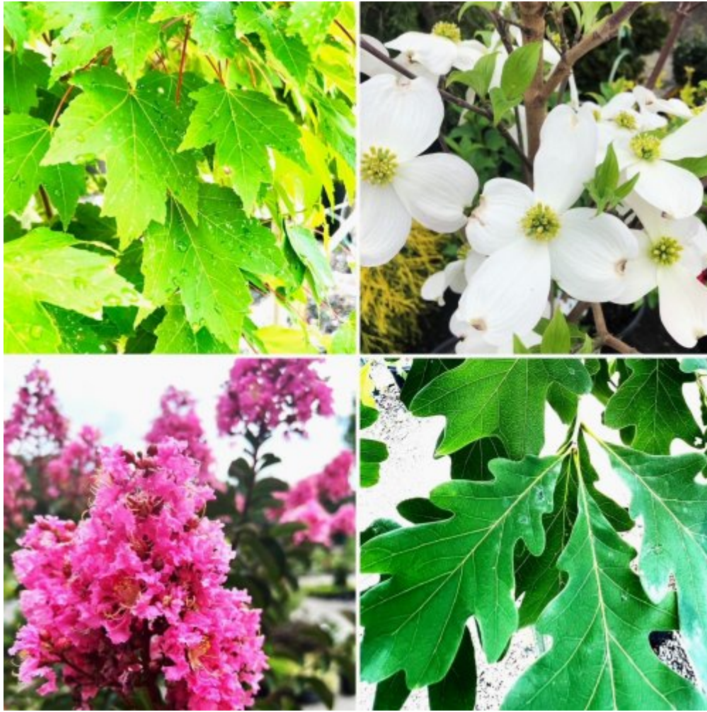
Clockwise: Red Maple, Dogwood, White Oak, Crape Myrtle

Strategize where you can add trees in your yard – keeping in mind placement for cooling our homes and summer entertainment areas while avoiding electrical wires. We have lots of great choices currently available, and our tree inventory offers an array of beautiful options for additions to your home landscape. Our staff is happy to offer advice for your particular needs. Delivery is available!