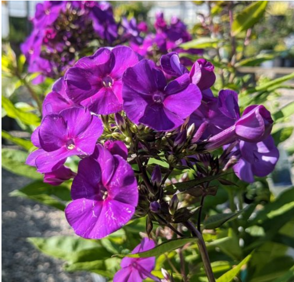
Tall Phlox – Phlox paniculata 'Luminary Ultraviolet'