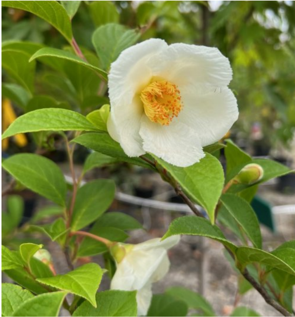
Stewartia in Bloom!