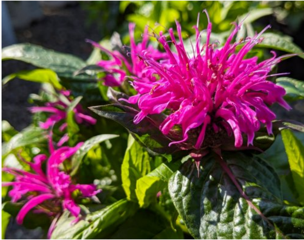
Bee Balm – Monarda "Electric Neon Purple"