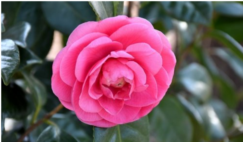
Camellia 'Jerry Hill'